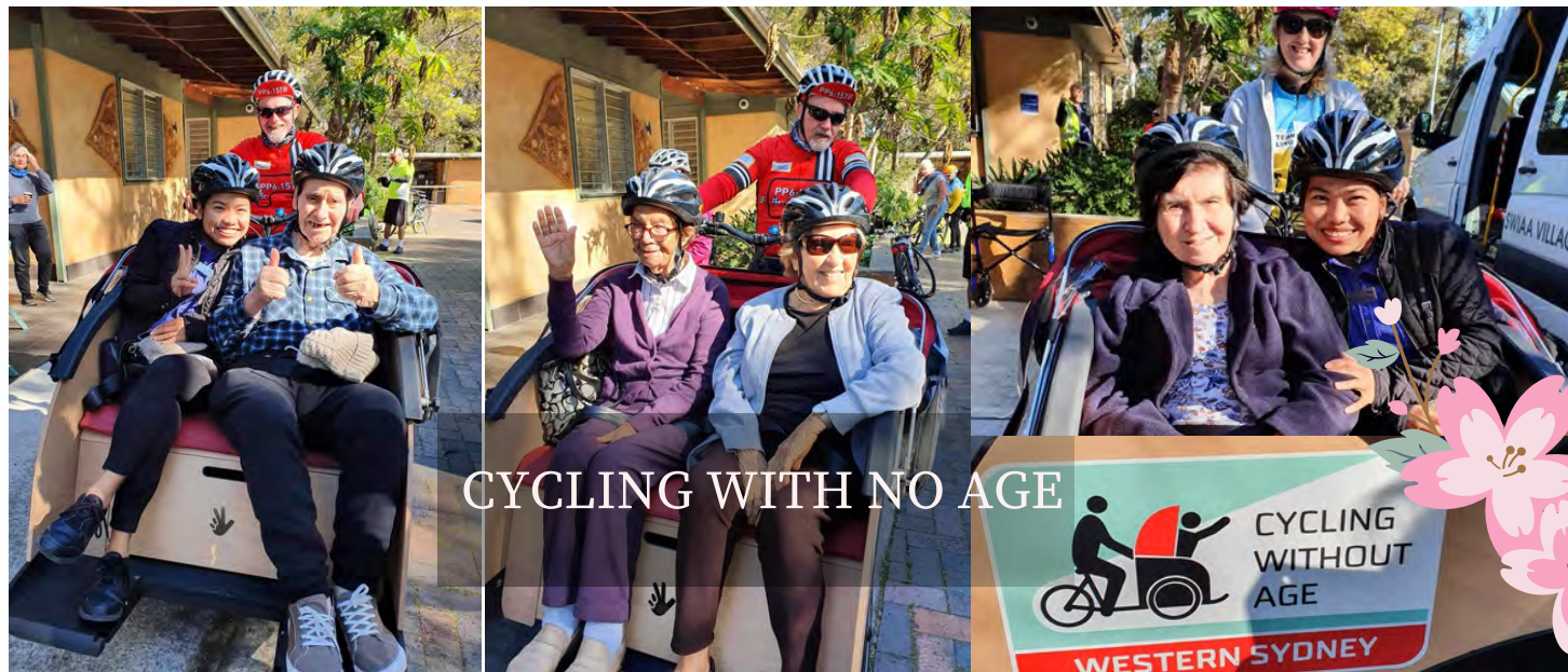
CYCLING WITH NO AGE

These are some of the highlights from Cycling Without Age event organized by Western Sydney Cycling Network on 10th August in Fairfield Show Ground. The event was a success and residents enjoyed it a lot. Look at their lovely smiles.